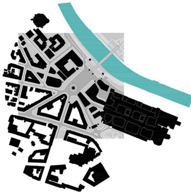
Figure 5: Skopje center – Macedonia square, urban context 2017.

Despite all the controversy and dissatisfaction among the public, the official 2012 Urban Plan for the city center of Skopje (Small Ring) continued its realization. The construction went beyond the referral year – 2014 and continued to develop in the years later, adding more new projects for buildings that were never officially presented to the public and were mostly constructed overnight (Figure 5). Namely, in 2010, 40 buildings were presented as part of “Skopje 2014”, and by 2017, 137 buildings and other categories were built in total (Prizma, 2018). According to the digital database of structures that make up the new face of Skopje - “Skopje 2014 undercover”, 28 new buildings, six multistory garages, 34 monuments, five squares, six facade covers, one panoramic wheel, four bridges, 39 sculptures, one triumph arch and many other buildings in many other categories were accomplished, all financed by public funds of approximately 684 million euros (Prizma, 2018). (Figure 6 and 7).