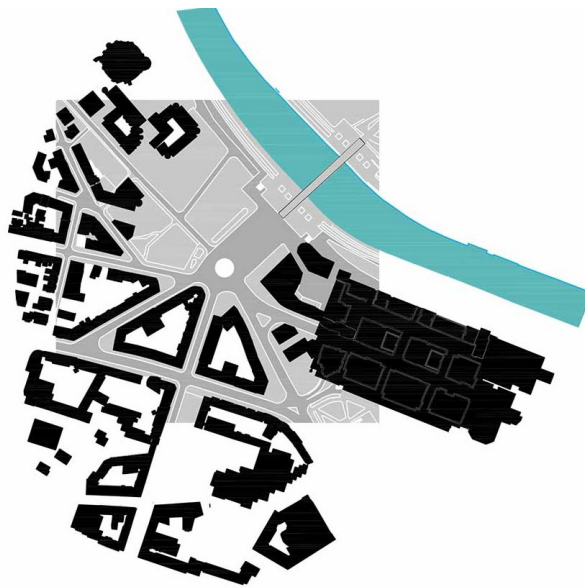
Figure 4: Skopje center – Macedonia square, urban context 2009.

previous period, in the transition period, the need for this kind of regulation has increased instantly, and many decisions had to be made to reform the system and make it more appropriate for the new market economies (Stanilov, 2007). At the beginning of the 1990s, new regulations such as the regulation for privatization of state property and the regulations for decentralization of the management, contributed toward municipalities gaining more power, independence, and financial autonomy to manage funds and coordinate local programs related to culture, education, health, public services and gain greater control over urban planning (Stefanovska, Kozelj, 2012). The struggle to put these changes into motion in a short time frame has resulted in many difficulties and complications in the law system. This process was used afterward by the new groups of political and capital holders who quickly learned how to take advantage of the shabby regulations (Stanilov, 2007). (Figure 4).