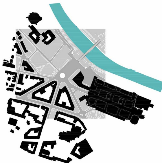
Figure 3: Skopje center – Macedonia square, urban context 1997.

After the breakup of Yugoslavia, Skopje has undergone several phases of radical, social, political, and economic transformations, processes that have had a major effect on the planning system and further influenced the city's built environment. Skopje's morphology has developed for 30 years accordingly to the Master Plan, and in the first years of transition, the city planning was in stagnation. Numerous factors in this period contributed towards creating a gap in the planning system (Figure 3).