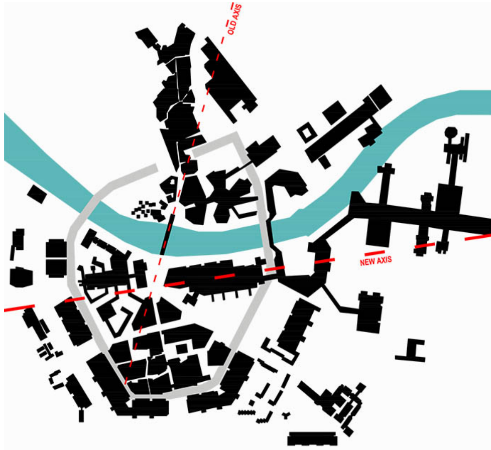
Figure 1: Skopje Master Plan 1965. Illustration: Jana Brsakoska

The city's construction was rapid, resulting in many modern buildings designed by local and international architects. The City wall alongside the train station was the first to be built, as the most needed at the beginning of the plan's realization. The outstanding architectural achievements can be recognized in many individual buildings in Skopje as a testimony of an era that successfully implemented new principles in the existing system. One of the marks of the modernization of Skopje is the City Trade Center (GTC), a building integrated into the Master Plan concept for the Trade center, along the west-east axis, very close to the city square. The Trade Center was designed by the architect Zivko Popovski and built in 1973, developed as a linear horizontal five-level composition around the already existing residential towers, and as an open structure that is easily approachable by pedestrian paths that flow into the main pedestrian street on the first floor. The architectural design enables free circulation inside the building, simulating a public area divided into zones where the trade units are accommodated. This building represents functionality, integrated with the city morphology and connected with the pedestrian and traffic infrastructure. This open urban structure will successfully contribute to the city economy and become a landmark for people's encounters in the next 30 years (Arsovski, 1980). (Figure 2).